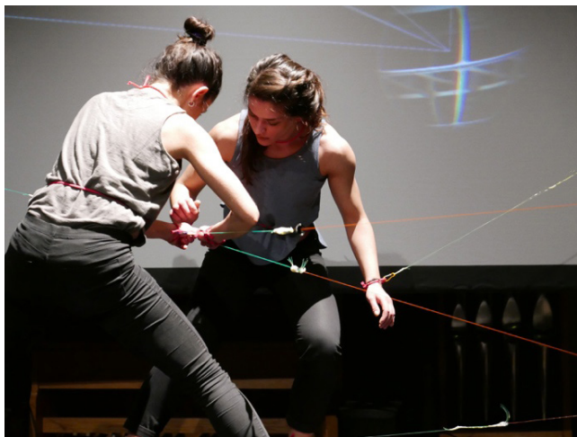
Video 1. The demonstration of composition process of Locus (2015). See: vimeo.com/252392147/29e5af8932 .

their bodies and to improvise to find out how to move within the restrictive conditions without sound. Second, once they got used to moving within the conditions, I then provided more specific choreographic tasks section by section depending on the structure of the sound composition. During this process, the dancers proposed how they would create choreography with my movement tasks and I selected good materials. Finally, we repeated the proposing, selecting, and modifying process several times until we completed the composition.